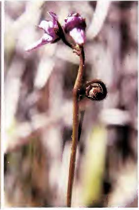
Figure 2: Utricularia livida, 1400 m a.s.l., Figure 3: Genlisea margaretae, 1400 m a.s.l., central highlands, Antananarivo.